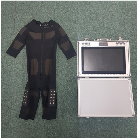
Figure 2. WB-EMS (whole body-electromyostimulation).

200 Hz, and the pulse amplitude range from 50 to 400 \mu s to allow for comprehensive and individual adjustments during the study. The training intensity and volume were increased according to the overload principle. EMS training was carried out in accordance with published studies that used the same EMS system for healthy adults. Each of the subjects underwent a test run for familiarization before the study began.